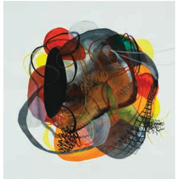
2018 SEASON ARTWORK