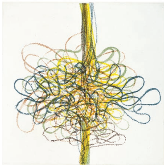
2017 SEASON ARTWORK

Alisa Dworsky, Fine Cord 60 monoprint etching, 9×9" on 22×15" paper alisadworsky.com