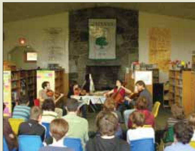
Educational workshop by the Ariel String Quartet at The Greenwood School, Fall 2008

Check www.yellowbarn.org for details or call 802-387-6637 ext. 102.