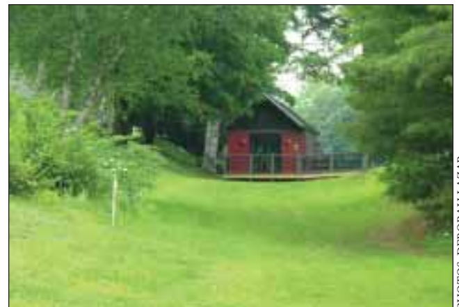
Music studio on Yellow Barn's campus at The Greenwood School

Pre-concert Discussions take place on Saturdays, July 11, 18, 25, and August 1, and 8 at the Putney Public Library, 55 Main Street, Putney, VT. These events offer an insight into selected works and a chance for audience members to learn more about the evening's program. Admission is free.