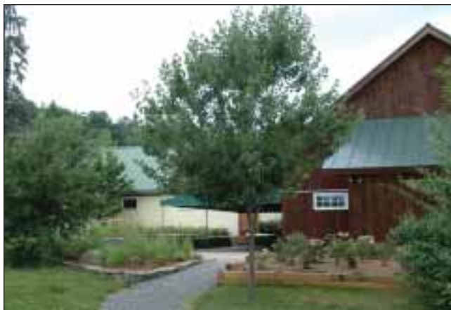
Big Barn Concert Hall, Putney, Vermont