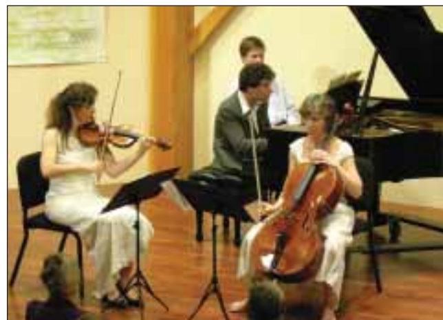
Yellow Barn performance

* Season Passes and Sextet Passes cannot be used for the Mountaintop Musicale on Saturday, June 27, the Gala on Saturday, July 18, and pre-concert suppers.